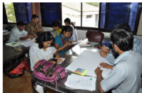
Volunteers & Teachers participated in the workshop by designing JetToy & Skimmer.