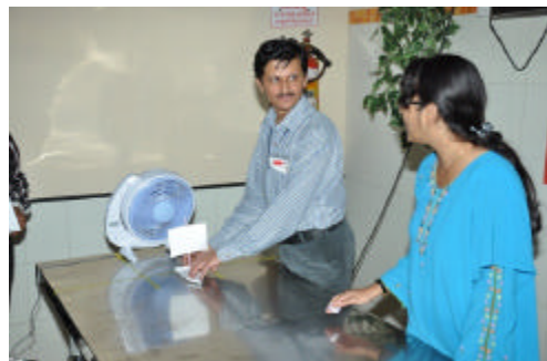
.....enjoying the testing of Skimmer.