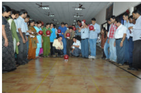
Testing the JetToy - Fun & Enjoyment