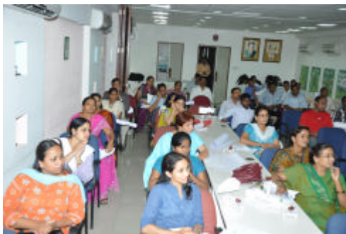
“Volunteer & Teachers” engrossed in the classroom sessions.

AWIM is a teacher administered, industry volunteer assisted program that brings Science, Technology, Engineering and Math (STEM) education to life in the classroom for students. Developed by SAE International in 1990, AWIM aims to promote science and mathematics literacy of students in standard fifth through eight by providing curriculum materials for authentic engineering design activities in the classroom that support a multidisciplinary, co-operative working experience.