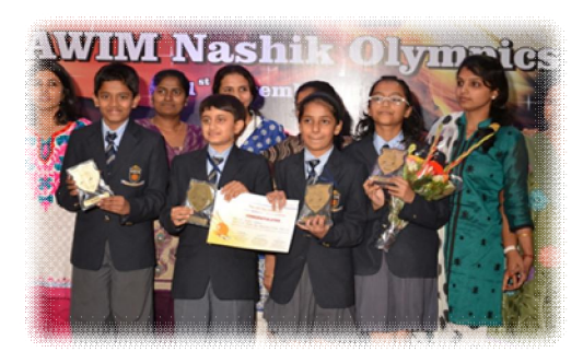
JetToy Winner - Wisdom High International School