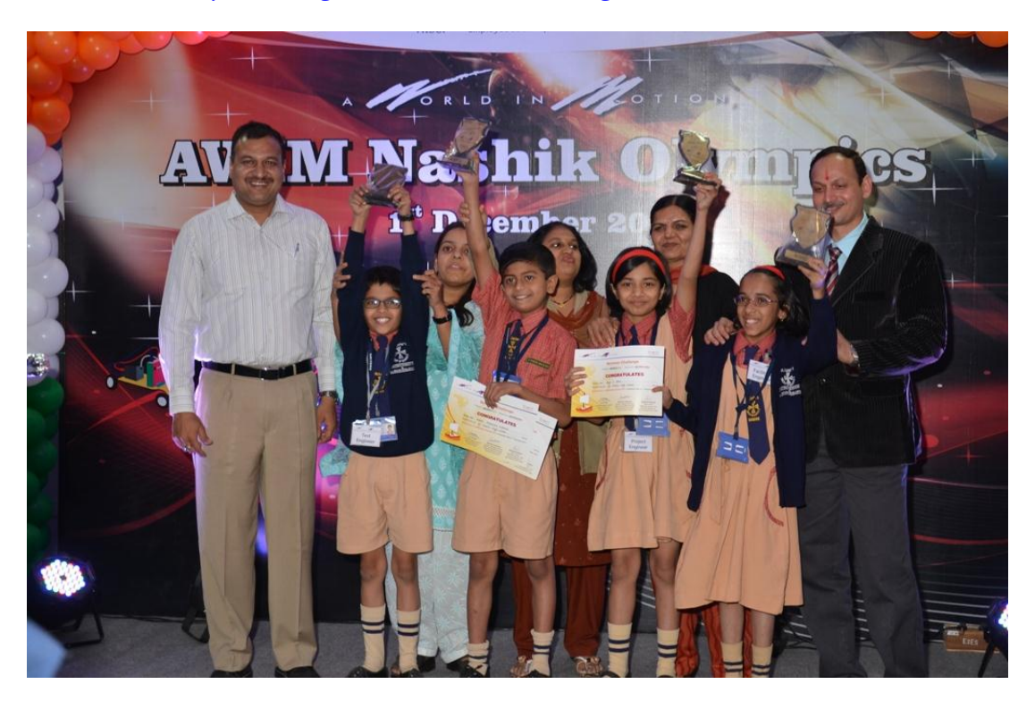
Skimmer challenge winners St Francis High School