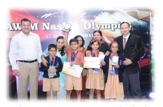
Skimmer Winner – St Francis High School

A World In Motion® brings math and science principles to life through highly interactive learning experiences that incorporate the laws of physics, motion, flight and electronics.