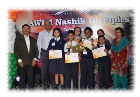
JetToy 2nd runner-up - New Era English School

A World In Motion® makes the challenges of math and science exciting by bringing authentic engineering design experiences into the classroom.