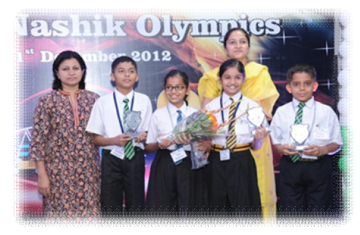
Skimmer 1st runner-up - Boys Town Public School