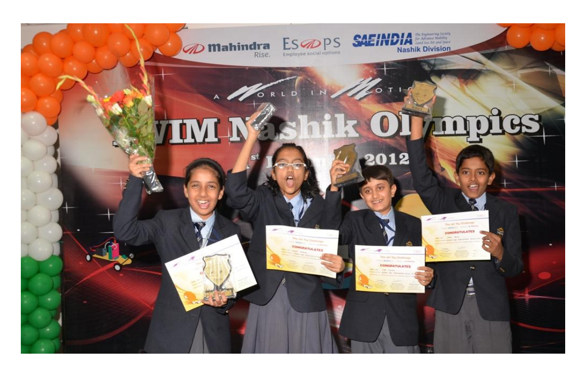
JetToy challenge winners Wisdom High International School