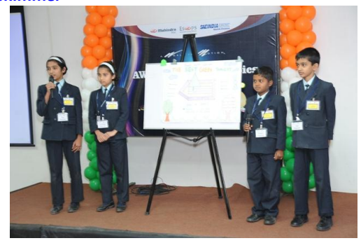
Presentation War - Students of JetToy & Skimmer challenge presenting their Innovative toy & their concepts.

A strong force of 43 Industry volunteers from Mahindra & Mahindra Ltd. , Nashik has invested their time & talent to train the students at their schools to be able to compete at the regional Olympics.