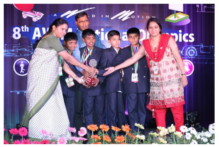
2nd Runner-up Jettoy Dnayanvardhini English Medium School, Chakan