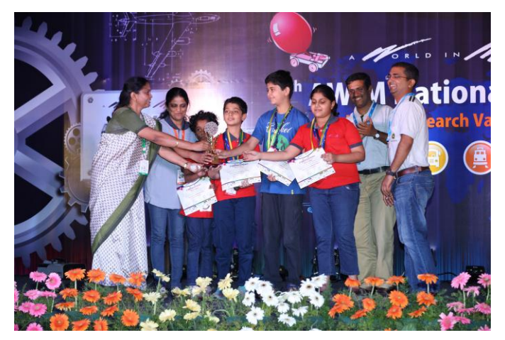
2nd Runner-up Skimmer Millennium National School, Pune