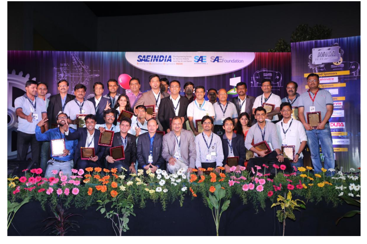
Organizing Committee : The Team which worked relentlessly to ensure that the event is a grand success.