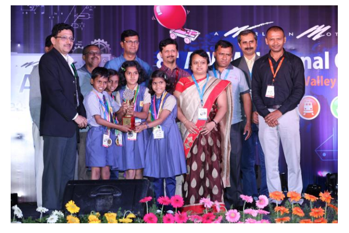
1st Runner-up Skimmer Swami Vivekanand Vidya Niketan, Nasik